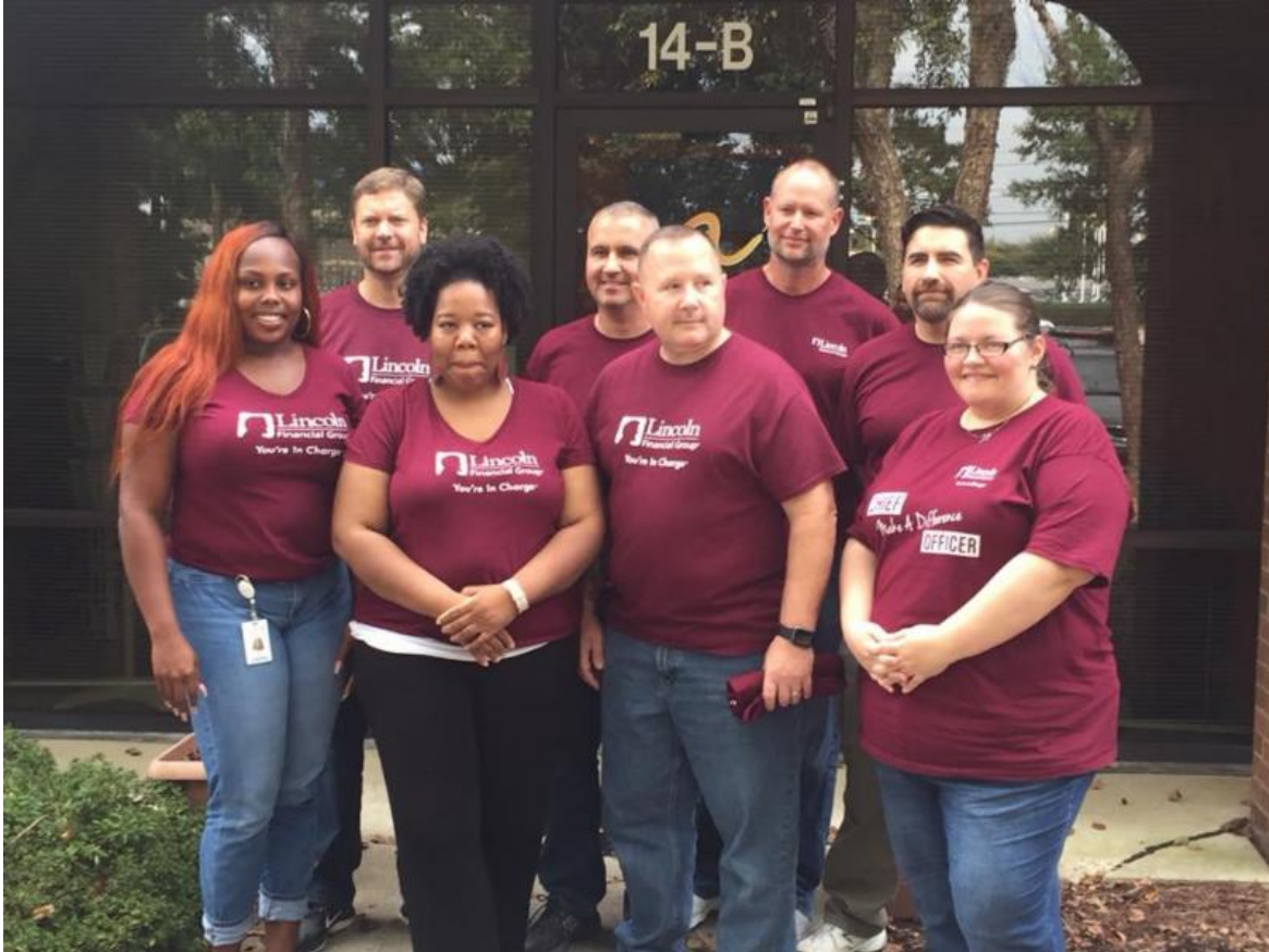
DMJ & Co., PPLC– CPA Day of Service.